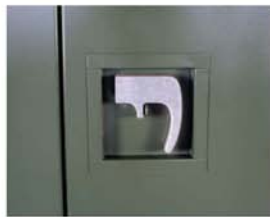
Recessed handle closed.

Central Moloney, Inc. produces three-phase padmounted distribution transformers, oil filled, 45 kVA and above, up to 34.5 kV voltage class. Our three-phase padmounted distribution transformers are designed and manufactured in compliance with all applicable ANSI and RUS industry standards for installation on three-phase underground systems.