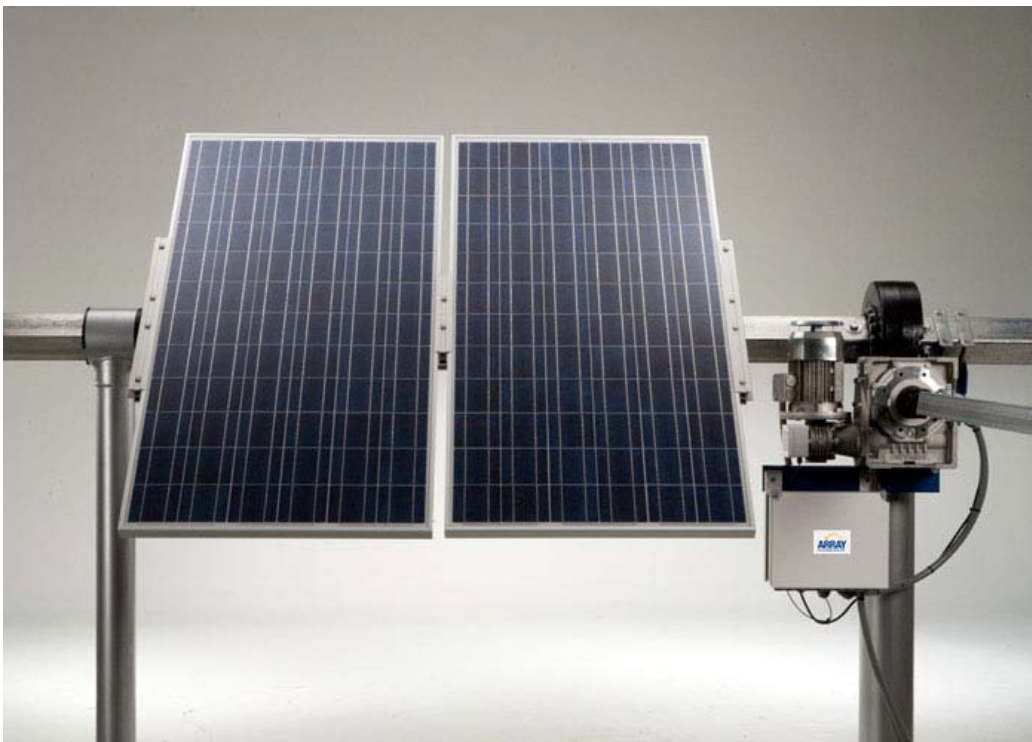
Photo Plate 2: Single-Axis Tracking System by RayTracker