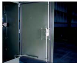
3-point latching mechanism.