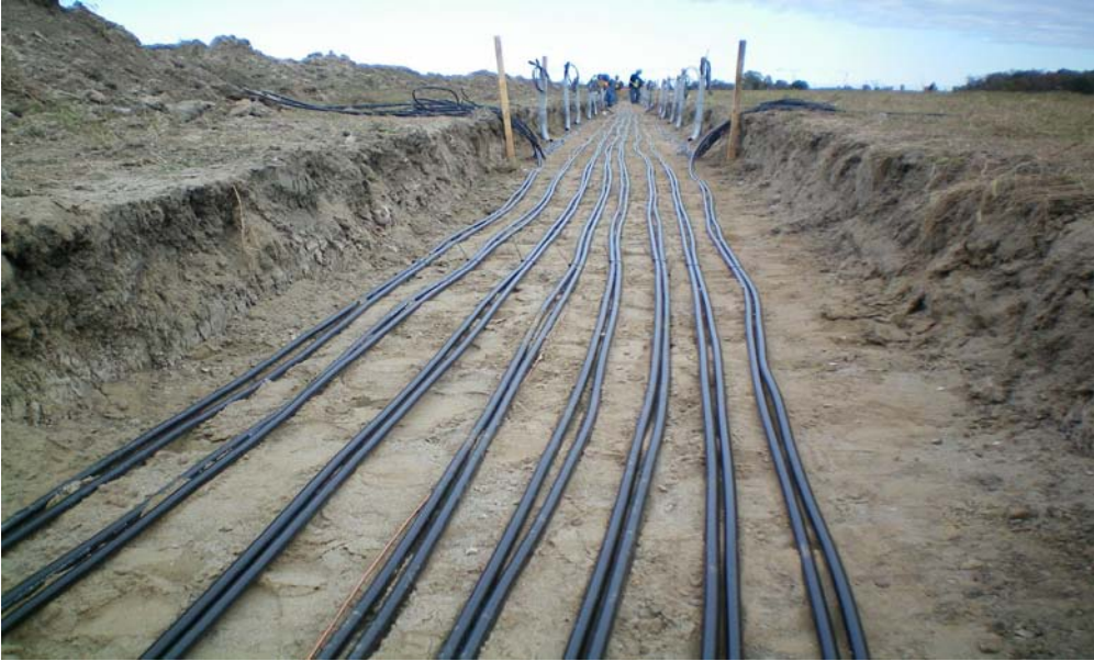
Photo Plate 7: Example of Cabling Being Installed in Trenches for Interconnection to Grid