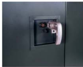
Recessed handle open.