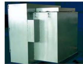
Handhole with tamper-proof cover.