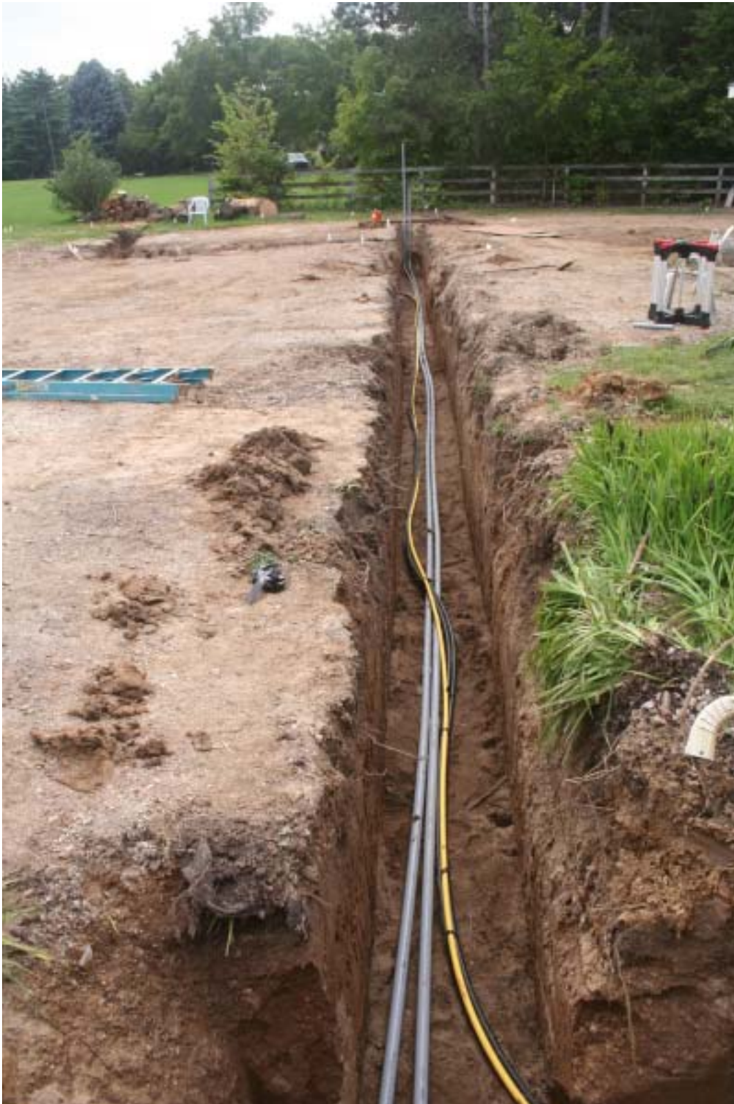
Photo Plate 6: Example of Cabling Being Installed in Trenches for Interconnection to Grid