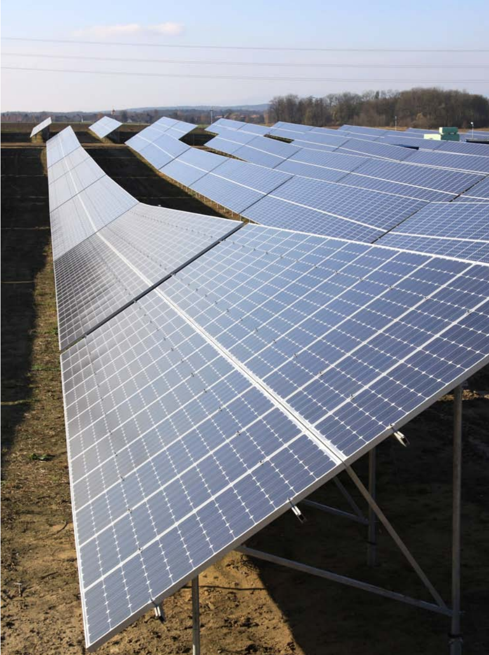
Photo Plate 3: Proposed Fixed Tilt Mounting Structure